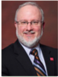
http://www.mpa.edu/ President of MPA