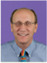
http://www.kenanpe.org President/ Product Management