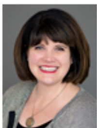
http://www.kenanpe.org CEO, CFRE, CSPG, FCEP