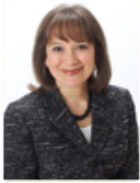
http://www.pisa.org/ President of America, Inc.